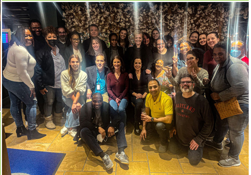
▼ Members of the PRMS Team pose between putts during the 2023 Post Holiday Par-Tee.